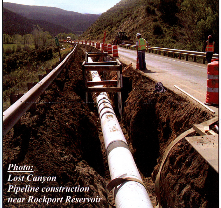
Photo: Lost Canyon Pipeline construction near Rockport Reservoir

Mountain Regional also recently completed a complete rehabilitation of its Atkinson Well #2, located in the Silver Summit area. This well will be used as an occasional source during peak summer periods and as an emergency standby source for the District if another well suddenly needed repair.